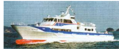
【New Oroshima - Oronoshima Route】