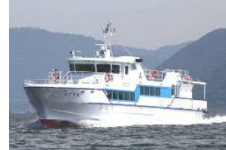
【Midorimaru - Genkajima Route】