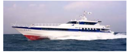
【New Genkai – Genkajima Route】