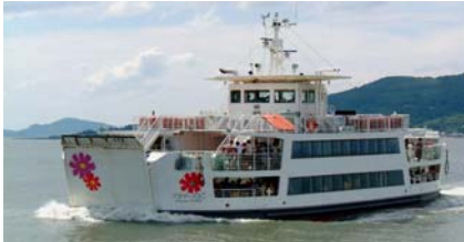
【Flower Noko – Noko Route】