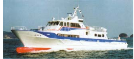
【New Oroshima – Oronoshima Route】