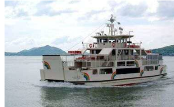
【Rainbow Noko - Noko Route】