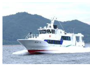
【Kinin - Shikanoshima Route】