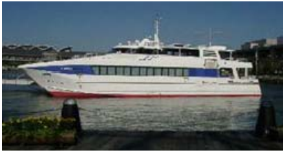
【Kinin 3 – Bay Cruise】