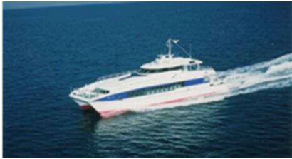
【Kinin 1- Shikanoshima Route】