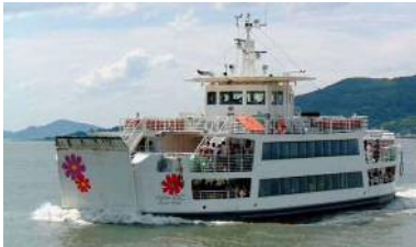
【Flower Noko - Noko Route】