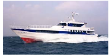
【New Genkai - Genkajima Route】