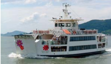
【Flower Noko - Noko Route】