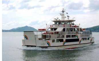
【Rainbow Noko - Noko Route】