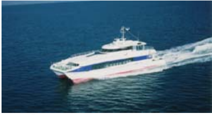
【Kinin 1-Shikanoshima Route】