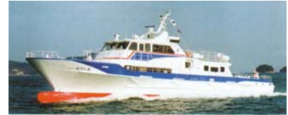
【New Oroshima - Oronoshima Route】