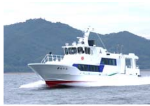
【Kinin - Shikanoshima Route】