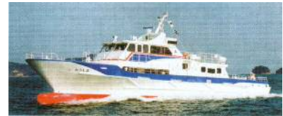
【New Oroshima - Oronoshima Route】