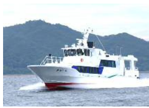
【Kinin - Shikanoshima Route】