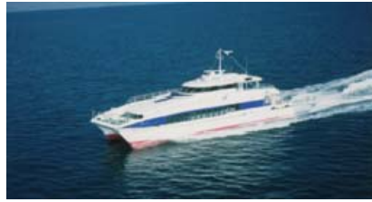
【Kinin 1and Kinin 2 – Shikanoshima Route】