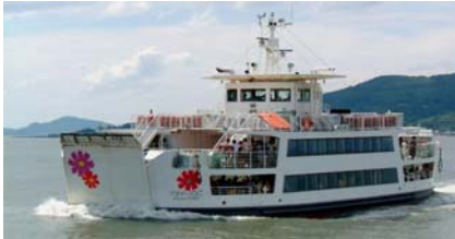
【Flower Noko – Noko Route】