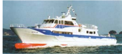
【New Oroshima – Oronoshima Route】