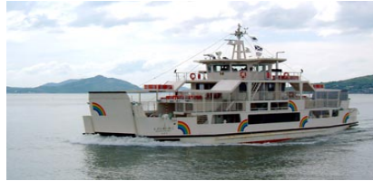
【Rainbow Noko – Noko Route】