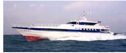
【New Genkai – Genkajima Route】